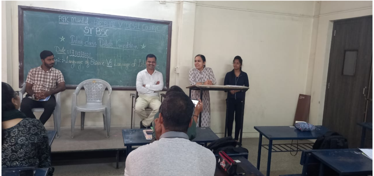
Students performing the activity- image 1